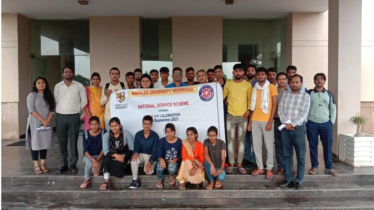
Caption: Group photo of NSS volunteers and faculty members at Raffles University during the NSS Day Celebration on 24th September 2021. The event emphasized the NSS's commitment to community service and the active participation of students in various social initiatives.